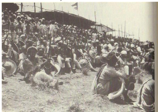
Meneliks predatory infantry: 1896 photo by Alfred Ilg Where the foot of habesha holds no grass sheds! (responses of Oromos during Meneliks invasion by his "fannos -arrogant, illiterate, ignorant infantry "trained police dog" who did what even no wild animals can do.

As a result of defending their land, It was estimated that over 5 million Oromos were massacred by Meneliks predatory infantry in 1900 within ten years alone, reduced to half of its estimated population Oromo neighbours massacred by Menelik, like Sidamas, Ogadenians and other indigenous people living in the region had also the same fate during his Hager maqnat , a projects of elimination. He conducted genocide, ethnocide, confiscated their land and property; the life of the captives was turned to slaves and sold as animals as his primary hard currency paid for the firearms. Today the primary hard currency of the current tyranny regime who adapted a Stalinist system to whom power meant a licence to corrupt, maim and kill, is our land and our natural resources.