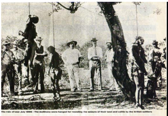
Analogy: the gruesome act of the British settlers on the people of Moashoans hanged for their heroic resistance against colonial Rhodesia seizing their land Baffour Ankomah A Bad Man in Africa?