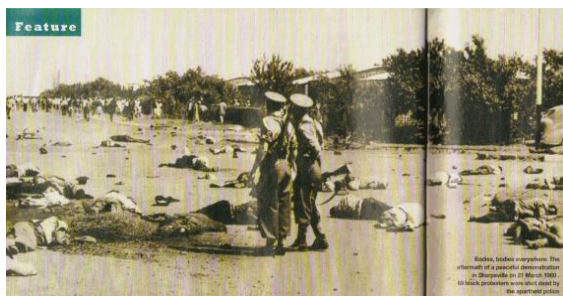
Bodies everywhere aftermath of peaceful demonstration in Sharpeville on 21 March 1960 69 Black protesters were shot dead by apartheid police“

“When you know who your enemy is, he can no longer keep you divided, and fighting, one brother against the other! Because when you recognize who your enemy is, he can no longer use trickery, promises, lies, hypocrisy, and his evil acts to keep you deaf, dumb, and blinded! When you recognize who you longer brainwash you, he can no longer pull wool over your eyes so that you never stop to see that you are living in pure hell on this earth, while he lives in pure heaven right on this same earth!” Malcolm X